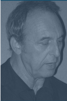
Guillermo Vázquez Consuegra Edificio per Case Popolari Rota, Cadiz, Spain,

The building for social housing designed in an expansion area north of Rota (Cadiz) has won a national contest organized by the Junta de Andalucía. It is a VPO block (Vivienda de Protección Oficial) composed of 90 flats, covering the final lot of a low cost residential dwelling regulated by a detailed plan foreseeing a patio arrangement for the component blocks. The conceptual choice deviates from the classical typology of the closed block which is typical of social dwellings of the 19th century, in which the internal private space and the external public space are clearly defined.