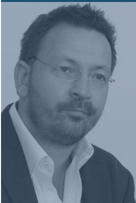
Kís Péter Építézmutterme Práter Street Social Housing Budapest, Hungary

The building, located in a dense residential area of the last century in Budapest, has the alignments of surrounding buildings as a theme for the project.